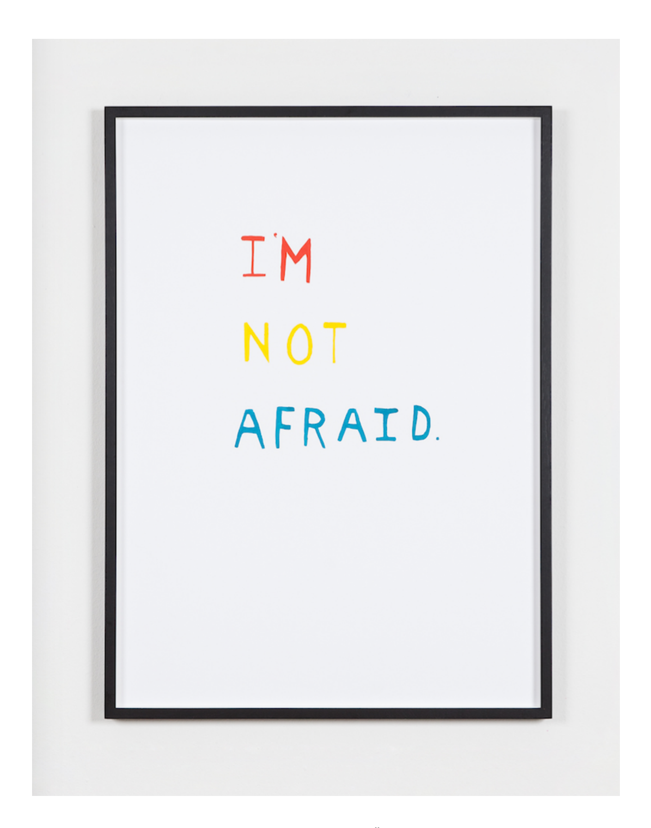
Christian Holtmann I'm Not Afraid 2016 Öl auf Papier 100 x 70 cm