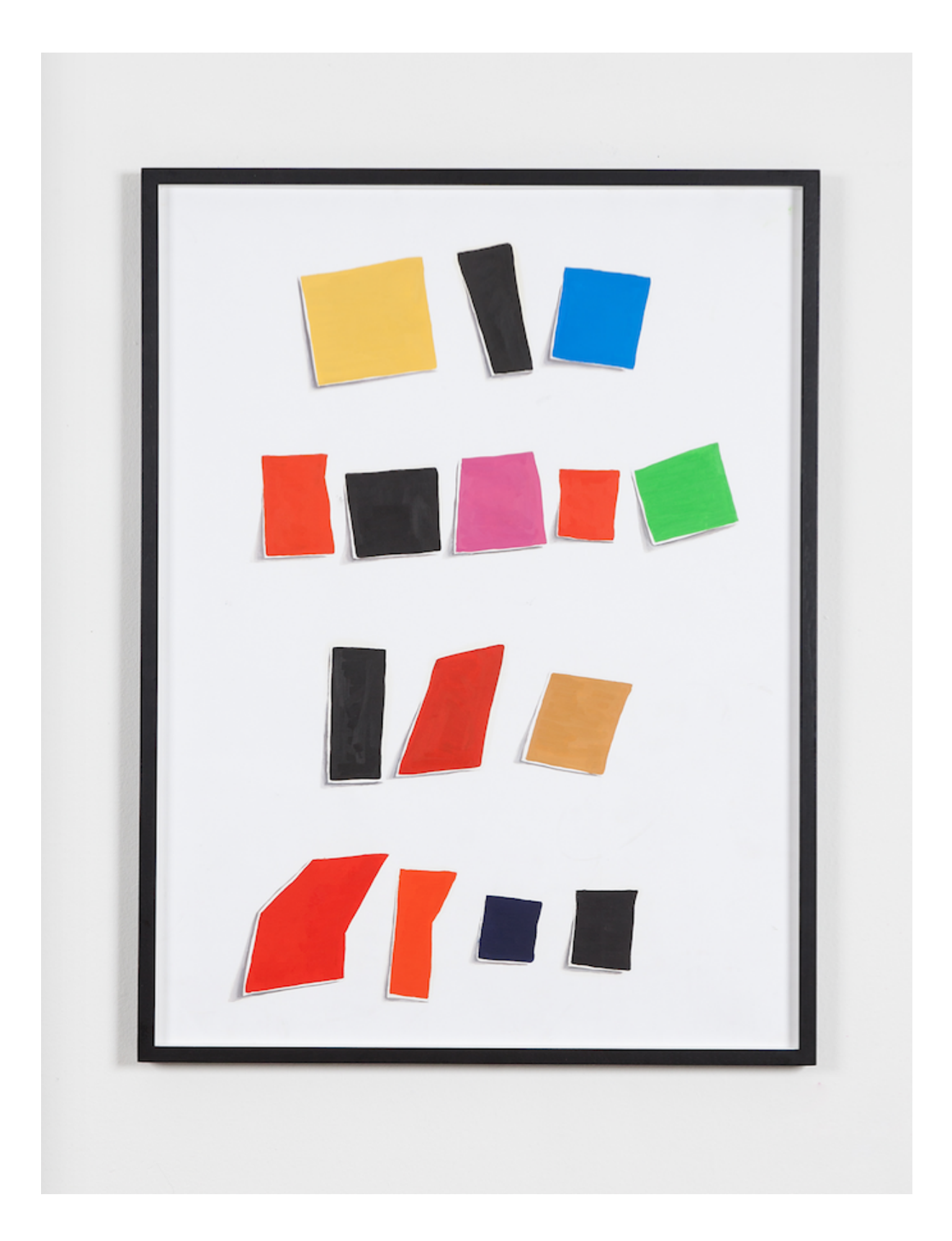
Christian Holtmann Wir haben ihr Kind 2017 Öl auf Papier 100 \times 70 \text{ cm}